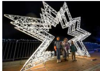
Starburst Photo Frame