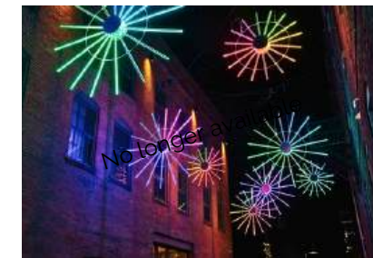
Skylar Starbursts (color changing)