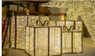
2' - 4' Golden Gifts