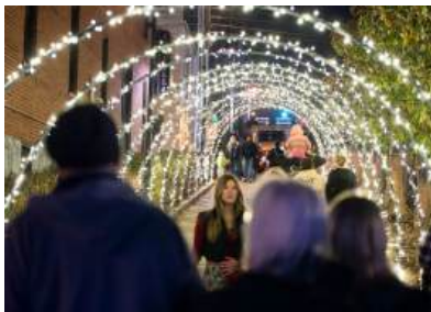
Arch Light Tunnel