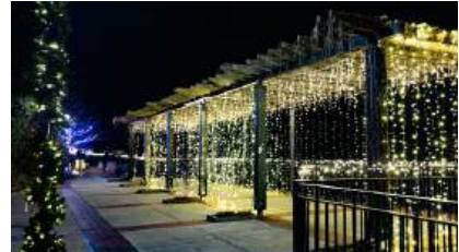
Pergola Light Tunnel