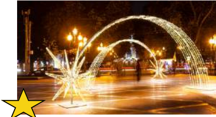
Star Bounce (2)