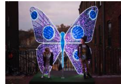
Butterfly (color changing)