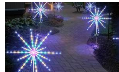
Color Changing Fireworks