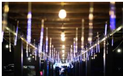
Icicle Pergolas (2)