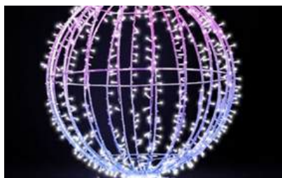
Color Changing Orb Field