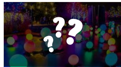
New Items TBD!