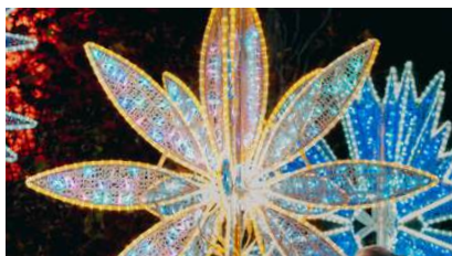
Light Up Flower Bursts