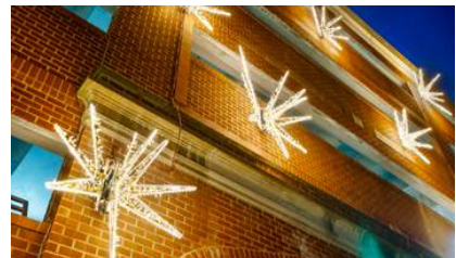
Star Burst Wall